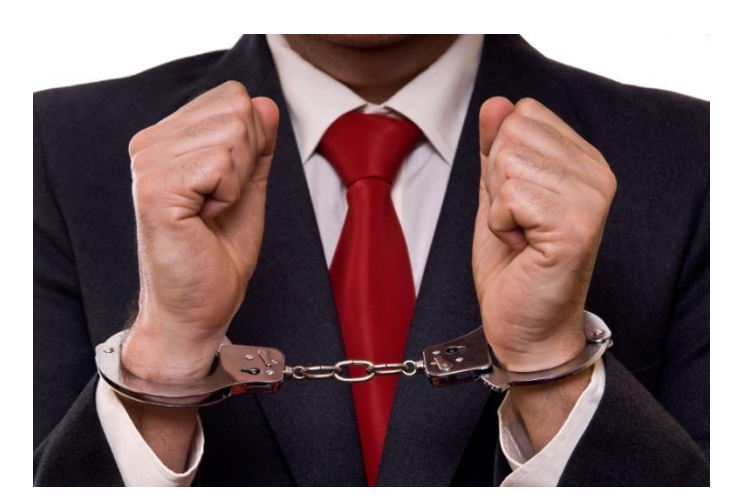
Click to learn more